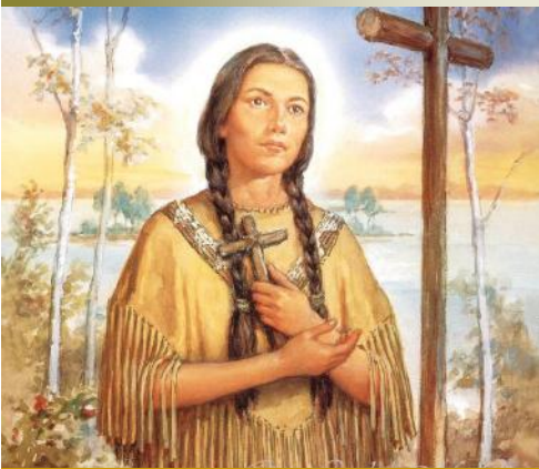
St. Kateri Tekakwitha July 14