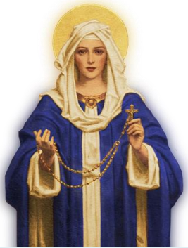
Our Lady of the Rosary, Pray for us! Feast day: October 7th