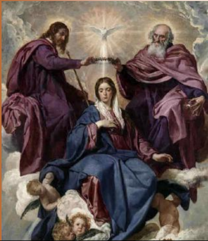
The Queenship of the Blessed Virgin Mary August 22nd