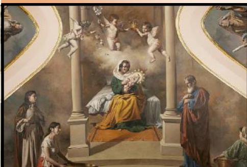
The Nativity of the Blessed Virgin Mary September 8