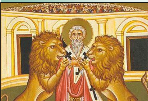
St. Ignatius of Antioch Feast day: October 17th