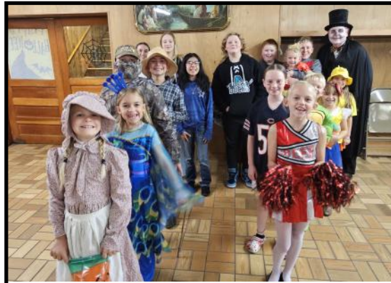
CCD students in their costumes for their Halloween party on Wednesday, Oct. 25th

Thank you for your generosity for World Mission Sunday! $1,148 was collected and forwarded to The Society for the Propagation of the Faith. THANK YOU!