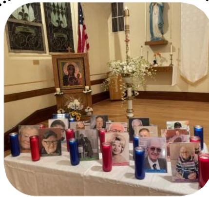
A picture from the All Souls Day Mass.

The pictures and candles are set up by the Divine Mercy image in church through the month of November.