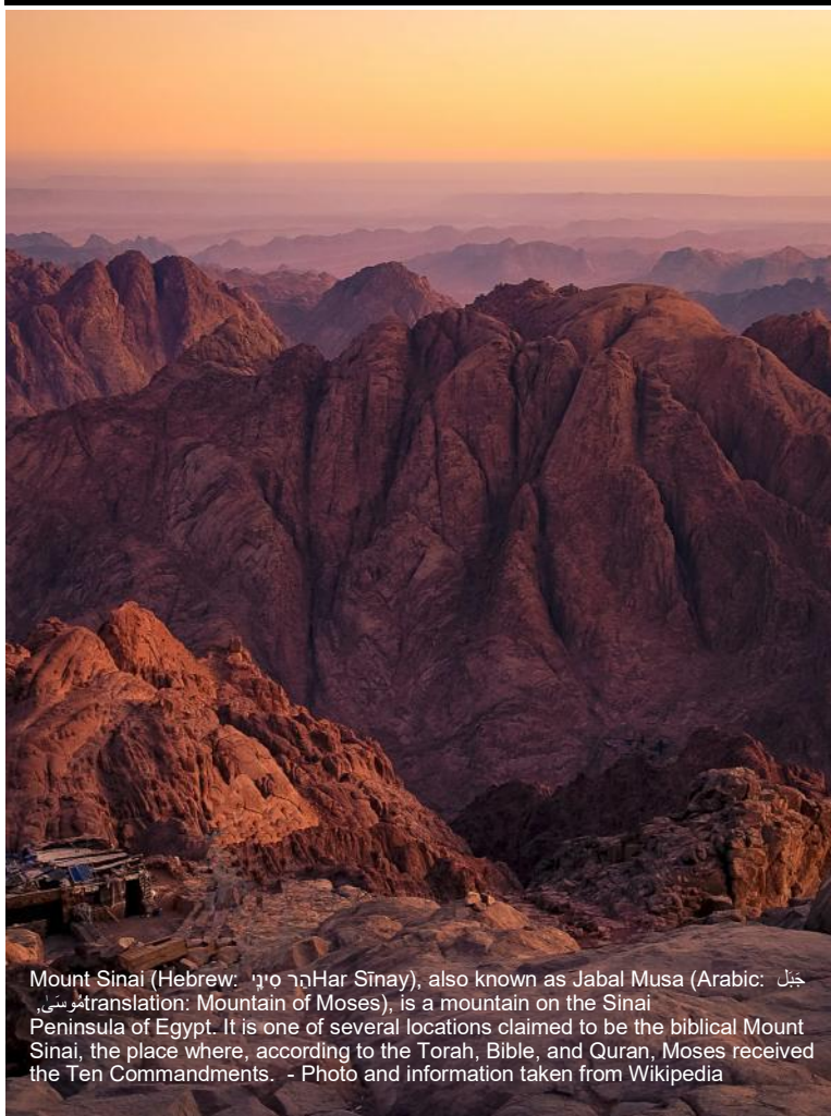
Mount Sinai (Hebrew: הר סיני Har Sinai), also known as Jabal Musa (Arabic: جبل موسى translation: Mountain of Moses), is a mountain on the Sinai Peninsula of Egypt. It is one of several locations claimed to be the biblical Mount Sinai, the place where, according to the Torah, Bible, and Quran, Moses received the Ten Commandments. - Photo and information taken from Wikipedia