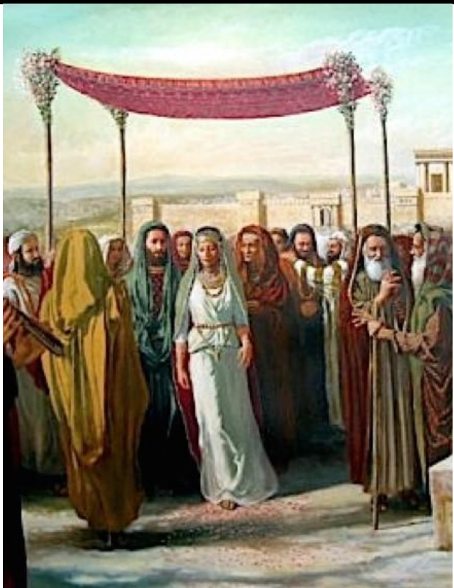
For this reason a man shall leave his father and mother and be joined to his wife, and the two shall become one flesh.