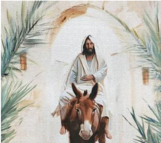
Christ became obedient to the point of death, even death on a cross.